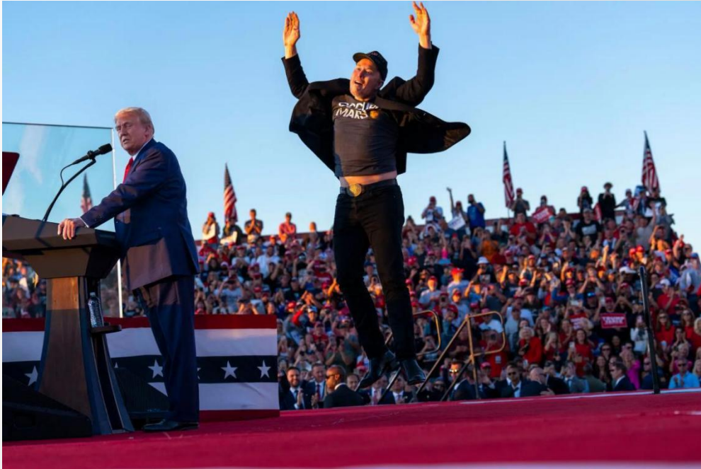
CEO of the social media platform X Elon Musk joins the Republican presidential nominee former President Donald Trump in a campaign rally in Butler, Pa.

In contrast to the campaign process of the Democratic party, the number of internationally influential figures from various circles participating in the Republican campaign trail was much less. For most of the occasions, the Republican campaign team had just depended on the influence and performance of the Republican nominee to mobilize the campaign process; and only at a later stage, the CEO of SpaceX, of Tesla, and of the social media platform X, Elon Musk, had joined the Republican nominee to campaign together on the stage.