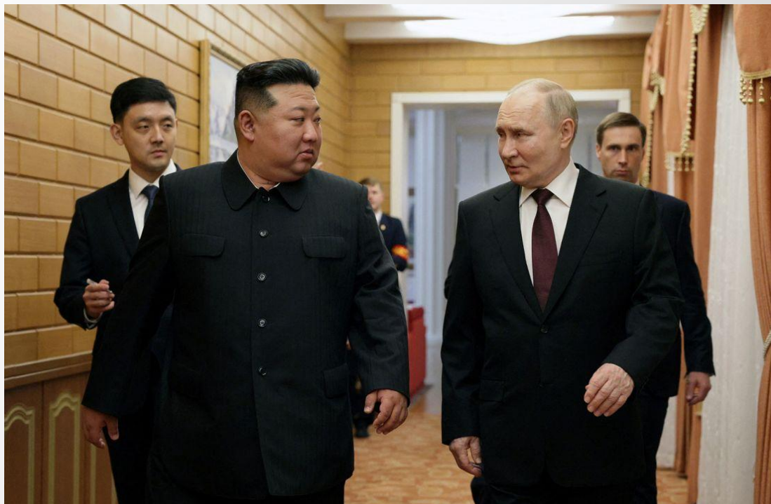
North Korean leader Kim Jong Un with Russia's President Vladimir Putin in Pyongyang on 19 June 2024.

On 21 November 2023, about two months after Kim's visit to Russia, according to South Korean intelligence, possibly with the assistance of Russia, North Korea successfully put a military reconnaissance satellite into the orbit after it failed twice in 2023. From North Korea's perspective, given the pressure faced by this country over the past decades, a deepening ties and enhanced cooperation with Russia in various areas apparently would serve the interest of North Korea.