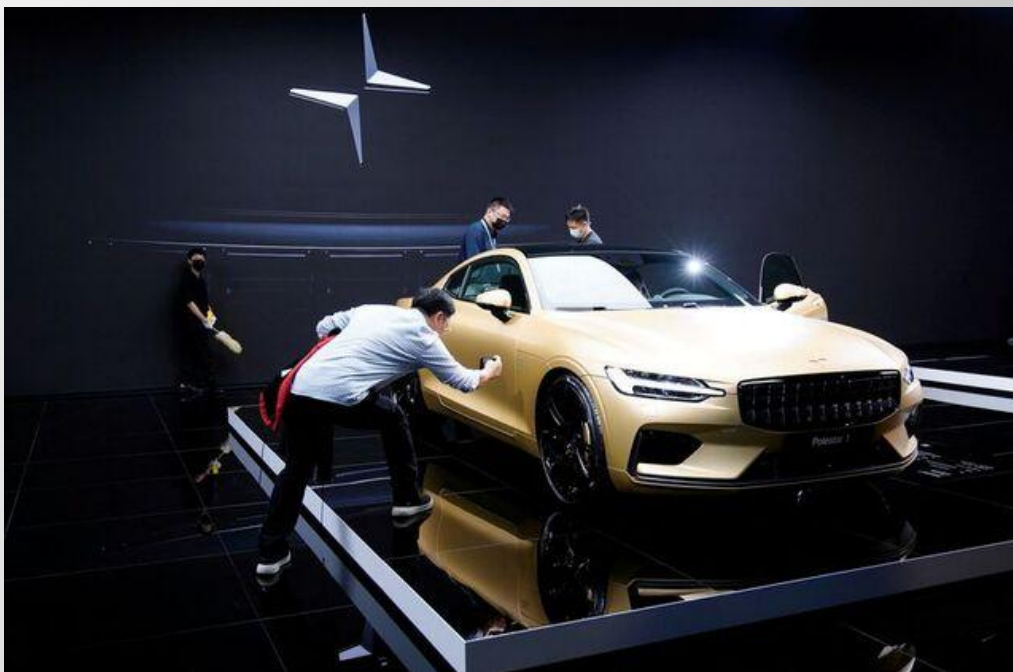
FILE PHOTO: Visitors check a Polestar 1 hybrid vehicle displayed at the auto show in Shanghai, China. 19 April 2021. (Aly Song/REUTERS/USNEWS)

According to the media reporting in early December, China and the EU are still consulting on finding an appropriate solution for addressing the recently adopted tariff measure on China-made electric cars. In the meantime, some car manufacturing companies have been seeking alternative means such as shifting to the production of hybrid cars to help offset the costs caused by the tariffs targeting electric vehicles.