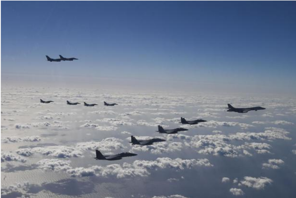
The U.S., South Korean, and Japanese air forces carry out a trilateral air drill at an undisclosed location on 3 November 2024.

The objective of the interactive measures and actions taken by the key parties over the past more than two years is quite obvious - the U.S., South Korea, and Japan attempt to show their strengthened position in dealing with North Korea; while North Korea is intended to demonstrate the inability of the U.S. and its allies in preventing North Korea from pursuing the country's goals.