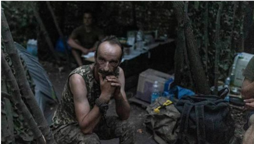
Ukrainian soldiers in a rear position in the direction of Pokrovsk, Donetsk Region, Russia, July 2024.

In the hope of improving the situation, in early August this year, the Ukrainian forces made a surprise incursion into Russia's Kursk region, with the purpose of diverting part of the Russian forces away from the battlefields in eastern Ukraine to help alleviate some pressure facing the Ukrainian forces there on the one hand, and of convincing Ukraine's supporters to continue aiding Ukraine's war with Russia on the other hand. Since the Kursk attack occurred, till mid-November, the Ukrainian military had already lost more than 32000 servicemen in the Kursk region. The Russian military is now in the process of carrying out a counteroffensive operation in the Kursk region . By the last week of November, the Russian forces had taken back over 40% of the lands occupied by Ukraine already in the Kursk region. The Ukrainian military has been struggling to hold its ground there obviously in order to make the Kursk fighting a bargaining stake for Ukraine. Meanwhile, on the front lines in Donbass, the Russian army hasn't been distracted by the Kursk incursion, and has been steadily moving forward.