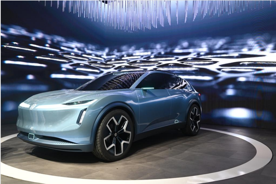
A Volkswagen's ID.CODE displayed at the 2024 auto show in Beijing, China. 25 April 2024.

The comparison of these numbers can tell that most of the China-made electric cars sold in the European market in 2023 were foreign brands including European and U.S. car brands. It can also reflect that the European, U.S., and other brands manufactured in China would be more widely affected by the recently adopted high tariff measure by the EU.