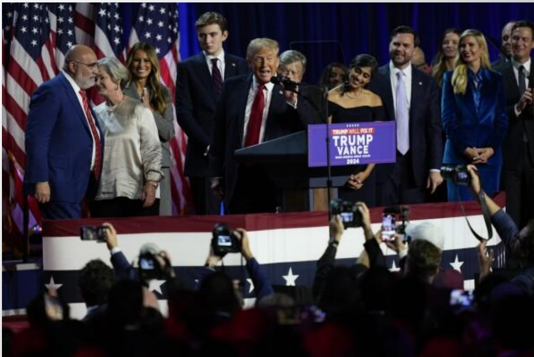
Republic presidential nominee Donald Trump speaks after winning the election at the Palm Beach Convention Centre in West Palm Beach on 6 November 2024.

The U.S. 2024 election was concluded in early November with the former president Donald Trump having won his second term; and this time he made a bigger win than he did in the 2016 election - the U.S. President-elect secured more electoral and popular votes, and all the swing states came to his favour in the 2024 election. Alongside the presidential election, the Republican party also won the Senate and the House of Representatives. Apparently, the U.S. 2024 election results have put the Republican party in a stronger position to govern.