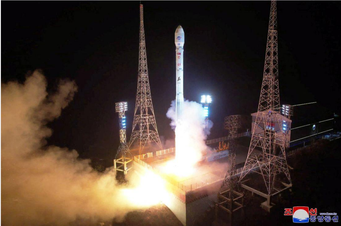
North Korea launched its first spy satellite, the Malligyong-1, in November 2024.