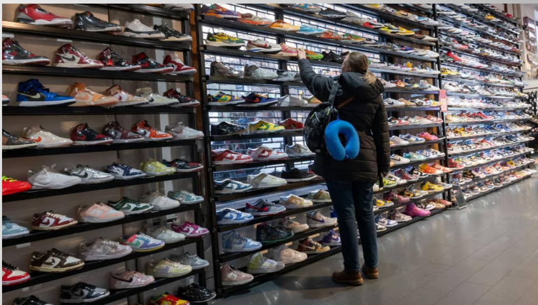
People shop at a retail shoe store in Manhattan on 5 January 2024, in New York City.

For instance, in May 2024, some major footwear business brands, in a letter jointly written to the U.S. president, urged the Biden administration to lift up the tariffs, and expressed that “we are confident that removing 301 tariffs will alleviate a costly burden in this key area and translate to savings for our shoppers”.