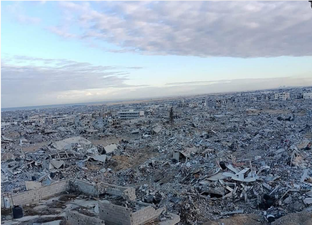
Rafah as it looks after more than a year of Israeli bombardment.

In response to the killing of the leaders of the Hamas and Hezbollah militant groups as well as to the suffering inflicted on the civilian population led by the Israeli forces' ground invasions into Gaza and Lebanon, Iran, launched missiles into Israel subsequently in April and early October, while Israel stricken back on the Iranian soil on 26 October.