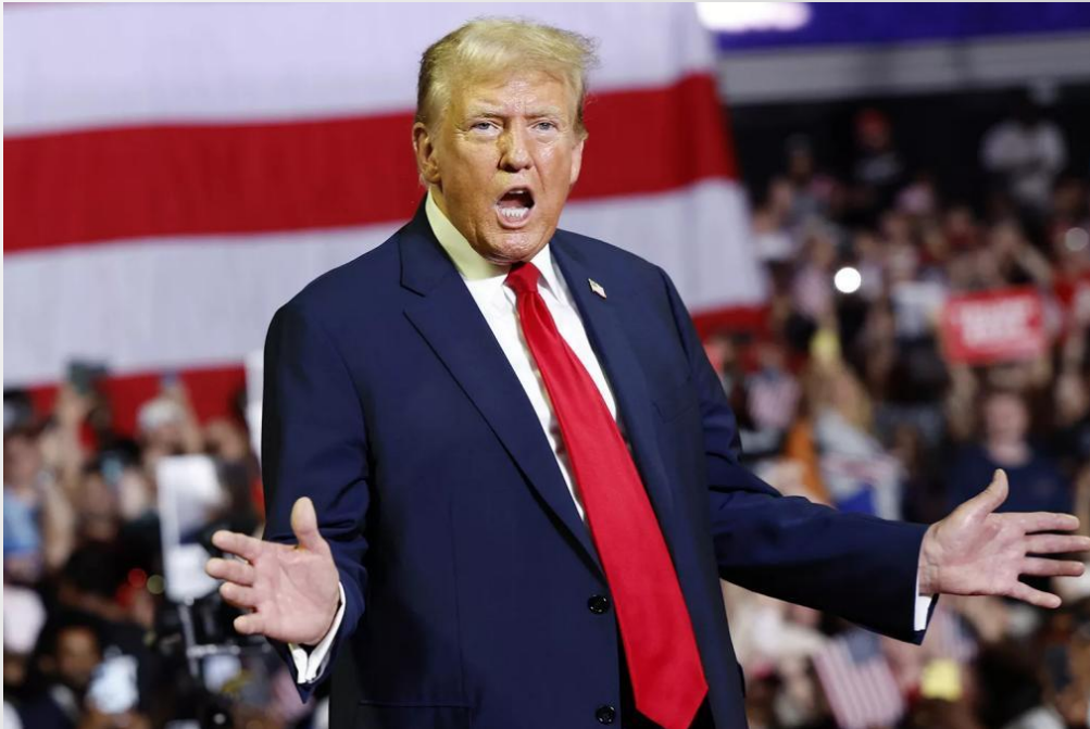
The U.S. Republican presidential nominee Donald Trump speaks in a campaign rally.

In relation to the presidential election result, generally, it is assumed that apart from the personal characters of the two U.S. presidential candidates Donald Trump and Kamala Harris, and the technical factors, which might play a role in affecting the election outcome, very crucially, the repercussions led by a series of key policies adopted by the current U.S. government were believed to have created a favourable chance for the Republican presidential candidate to win.