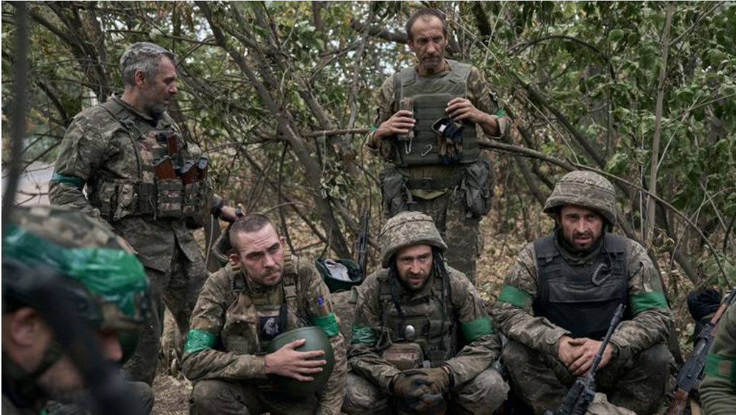
The Ukrainian service men in areas southeast of Pokrovsk, the Donetsk People's Republic.

The latest development of the situation in Donbass was that, because of failing to stop Russian forces from advancing toward the key city of Pokrovsk, the commander of Ukraine's Donetsk group of forces had been dismissed.