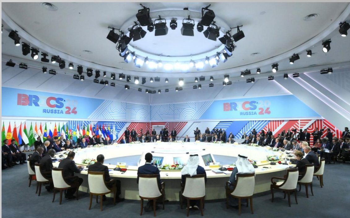
Expanded meeting of the 16th BRICS Summit.

The BRICS bloc was founded in 2006, with Brazil, Russia, India, and China as the founding members, and later in 2011 included South Africa and in 2024 Ethiopia, Egypt, Iran, and the United Arab Emirates into this grouping. Over the past years, the influence of the BRICS initiative, as an emerging force in the economic field, has been rising; and now the group accounts for about 45% of the global population and 35% of the global GDP in purchasing power parity. A number of countries have expressed their interests in joining or partnering with this bloc.