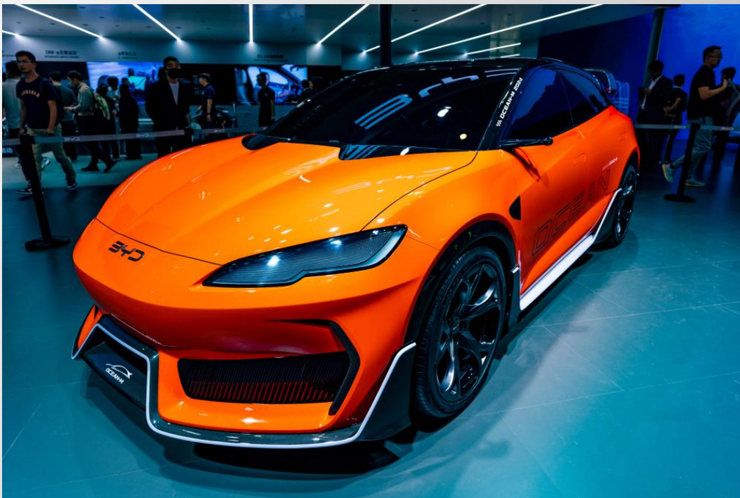
A BYD Ocean-M electric car displayed at the 2024 auto show in Beijing, China. 25 April 2024.

After having spent about a year investigating into whether or not the Chinese electric vehicles received subsidies from the Chinese government, a tariff measure with adding up to 35.3% tariffs based on the original 10% rate imposed by the European Union on China-made electric vehicles came into effect on 30 October 2024. The EU members widely disagreed on the adoption of this tariff measure, as a senior EU official spoke anonymously, “we disagreed on each and every fact that we established in the investigation”, and “it was a broad disagreement.”